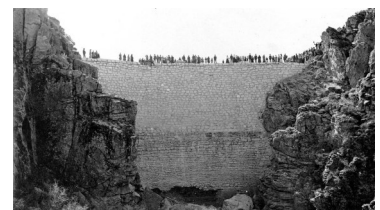
Enterprise Reservoir Dam

Pioneer Settlers entered the area in the late 1800's and settled a few miles West of present day Hebron. Those industrious pioneers had a grand plan to build a large dam to help store a sizable amount of water for irrigating their crops during the dry summer season. This allowed them to irrigate far more land and to move farming into the broad valley East of Hebron. Soon a new townsite was plotted and most Hebron residents moved to present day Enterprise.